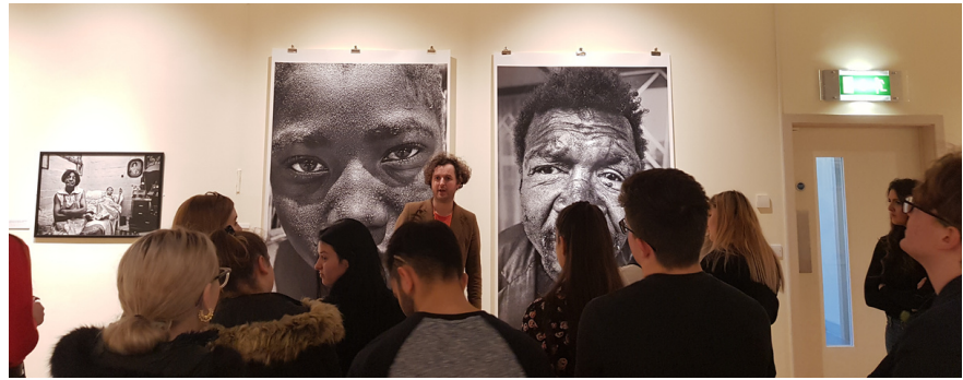
GA Visual Arts students during a gallery visit

Potential careers in the Arts include: graphic design, fine art, illustration, jewellery design, product design, printmaking, textiles, photography, fashion, interior design, culture and heritage, education, ceramics, animation, architecture, and many others.